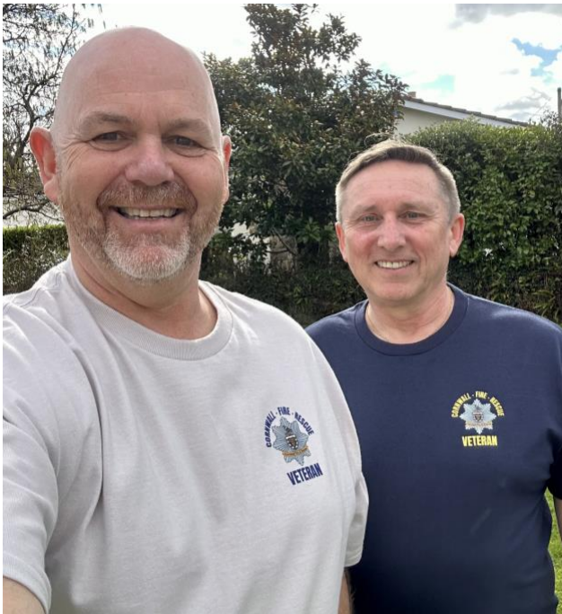
Two more CFRS RMA mugs in branded T shirts

The plan is that by the end of April we will be able to provide you with a list of prices and merchandise available and how to place your orders. We will also place this information on our Facebook and Website, as well as future additions of the 'Beacon'.