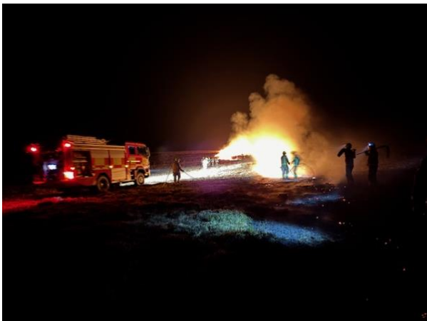
Perranporth crews utilising the 'pump and roll' feature at a recent gorse fire

The new appliance proved invaluable in helping to extinguish a rapidly spreading wind-blown wildfire.