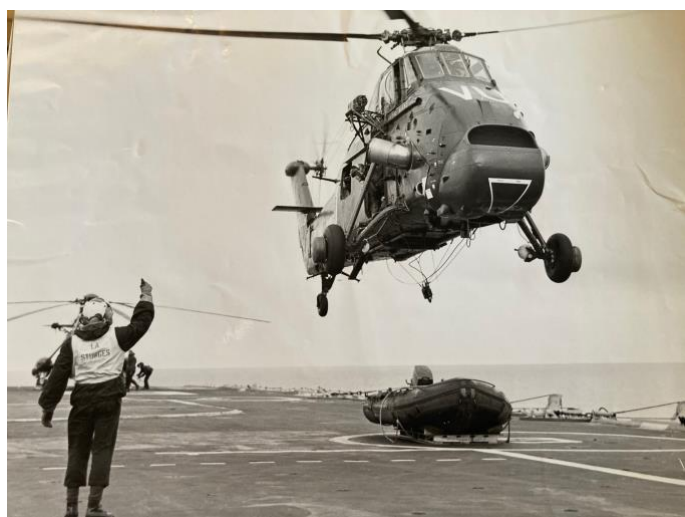
Directing Helicopter underslung pick up of Royal Marine Inflatable Raiding Craft Circa 1980/81

We also have wholetime Firefighters from both Cornwall Fire and Rescue Service and London Fire Brigade whose shift patterns enable them to be available to serve their local community when they are off duty from their wholetime roles.