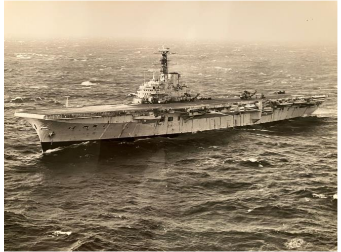
HMS Bulwark Circa 1980/81

Ark Royal, HMS Bulwark and MV Keren, all final commissions.