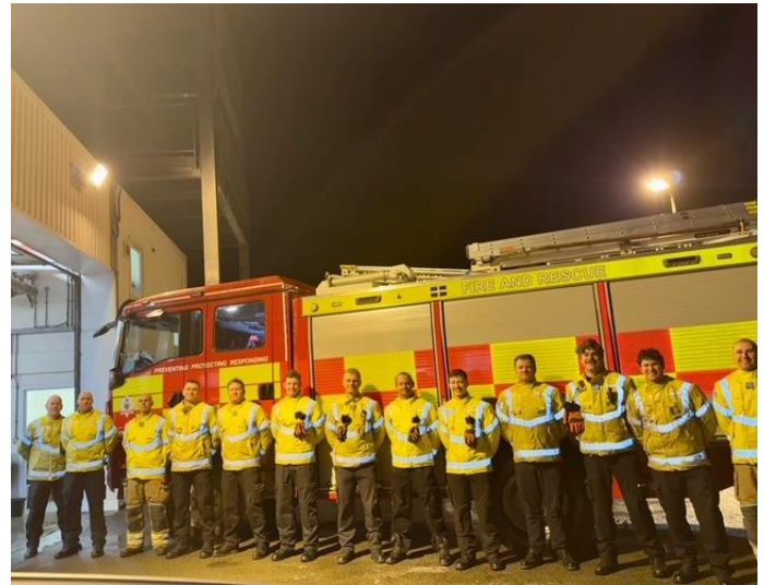
A proud Perranporth crew with their new appliance

grotto and car washes for the Firefighters Charity as well as fund raising events for the 'Movember' charity.