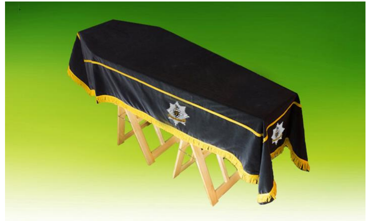
Illustration of the CFRS Coffin Drape design

As referenced in the Chairmans update, the RMA have purchased a coffin drape in Cornwall colours with a Cornwall Fire & Rescue Service badge to honour and pay tribute to past members of the Service. CFRS stores will hold the drape for use when requested by the families of fallen comrades. Where possible, the Service have agreed to deliver the drape to the funeral directors, where this falls within a scheduled delivery to that area. However, ultimately responsibility for the collection and safe return of the drape will need to be considered as part of any funeral arrangements.