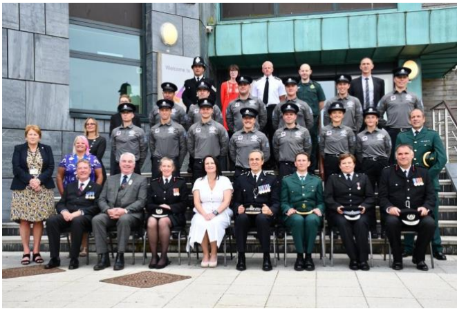
The 2021 TSSO Cohort pass out photo

Last year an adjournment debate was held in Parliament to promote the role.