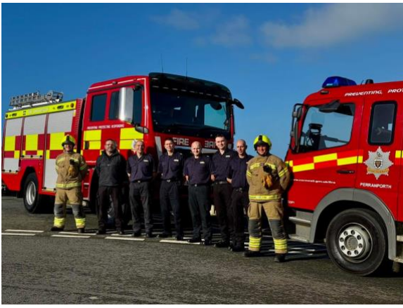
Farewell to the old, welcome to the new!

For the last 20 years or so Perranporth's major appliance has served the community very well, however in February, our new appliance, a MAN 4x4 fire engine, has replaced our trusty Mercedes and already has started showing its capabilities.