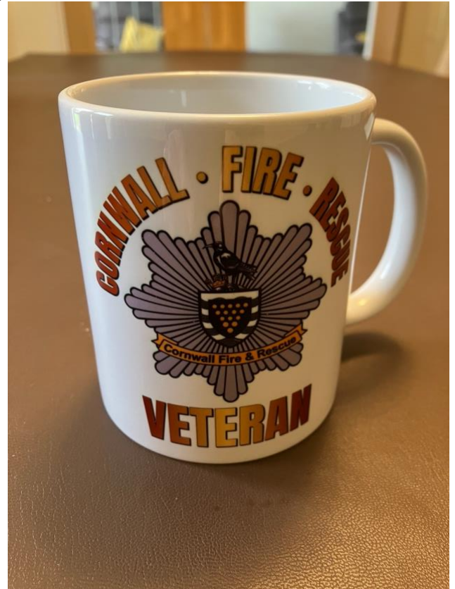
Example CFRS RMA Mug

Available will include T-Shirts, Polo Shirts, Sweatshirts, Caps, Beanie Hats, Mugs and lots more. Samples of some items are shown hereto illustrate what is available to members at a vastly reduced rate to the normal retail price.