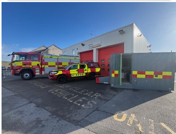
Perranporth fire station with their Wrl, LAP and Welfare Unit

Perranporth fire station currently has 14 firefighters all dedicated to serving their community as firefighters but also living and working locally as well.