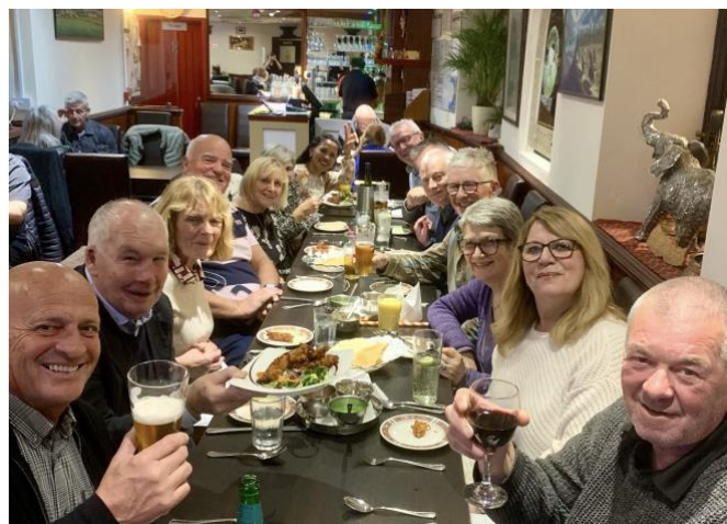
Cheers to a great evening!

The first event was on Friday 28 th March involving an informal get together at the Old Ale House in Truro, followed by a curry in the Katmandu restaurant. With 14 of us gathering, this was a great opportunity to expand our social activities, and it was pleasing to get the support at this event despite relatively short notice.